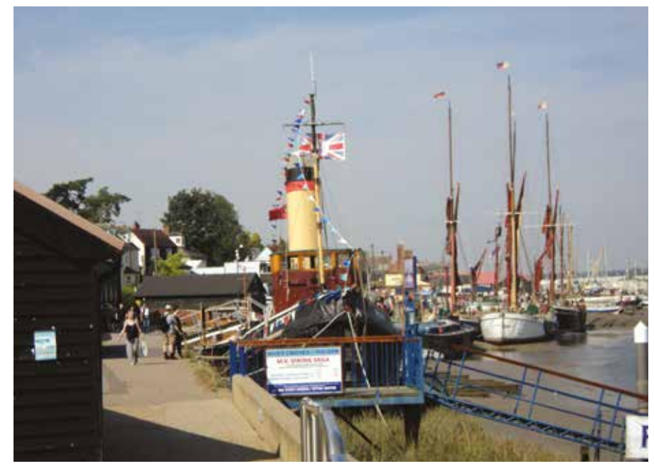
The steam tug Brent is moored at Maldon in Essex.

Many barges and similarly sized vessels, including narrowboats, tugs, former lifeboats and smaller sailing vessels, have survived entirely through private ownership and without any grant support, partly a reflection of increasing affluence and growing leisure activity. Many historic hulls have survived