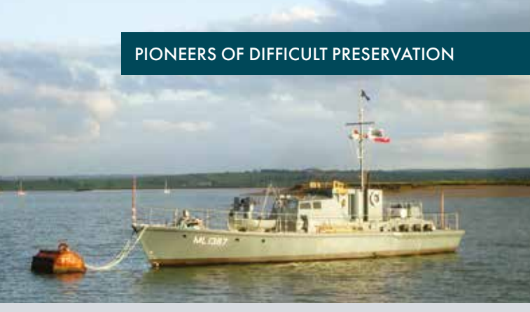
WW2 motor launch HMS Medusa