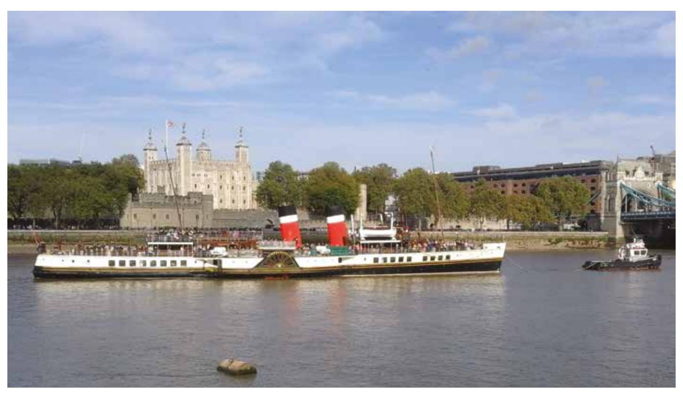
The paddle steamer Waverley turning off the Tower of London.

lecturing at Poplar College in London's East End) and acquired by them in 2000, remaining fully operational throughout.