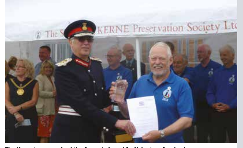
The Kerne team received the Queen's Award for Voluntary Service in 2018.