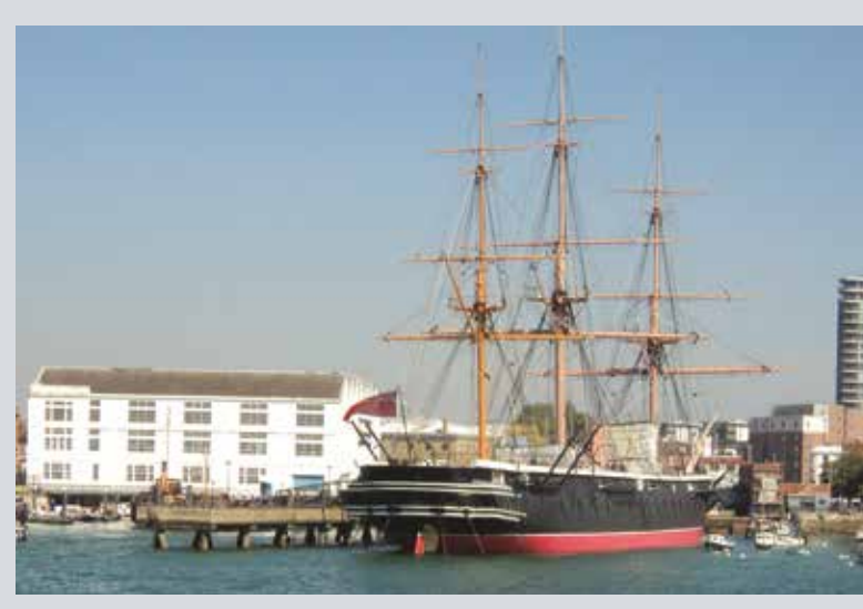
HMS Warrior in Portsmouth's Historic Dockyard