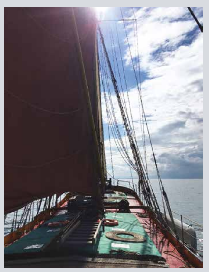
The barge Blue Mermaid under way.

Continued operation (with a viable business plan) was one of several new approaches to keeping old vessels going. An increasing number of wooden sailing vessels were restored and followed this path. A good example is the